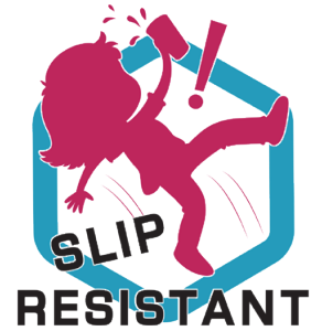
BRIGHT BLUE B23

Manufactured by SHIMICOAT, the products are odourless, self-levelling, easy to apply and engineered to be ideally suited to Australian conditions.