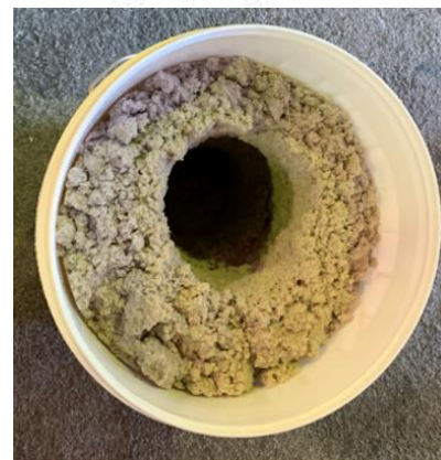
Hole Holding Test – Non-Sagging Epoxy