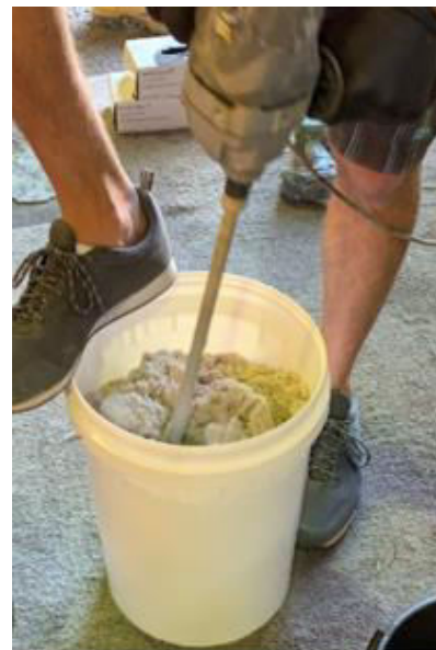
Mixing Epoxy Mortar

Mix thoroughly for a minimum 3 minutes manual or with mechanical mixer at low speed (750rpm Max) to ensure uniformity of the product.