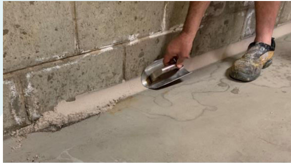
Trowelling Epoxy Mortar into the corner using Coving Device