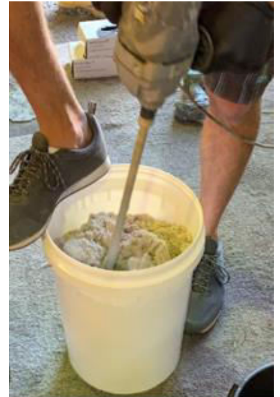
Mixing Epoxy Mortar

The coving application is now complete. Ideally, we recommend to cover it with Epoxy or other coating materials when you apply surface coating to the entire floor.