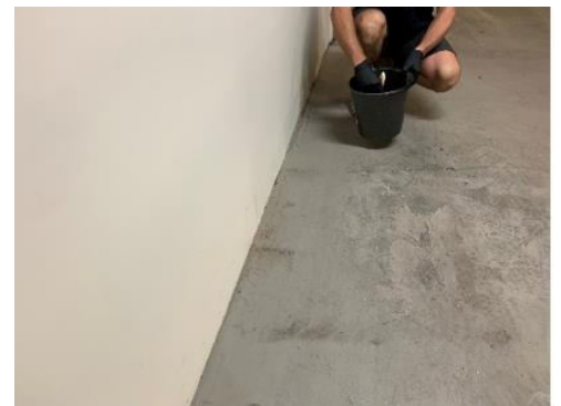
Xylene Wipe corners with Sponge or Brush