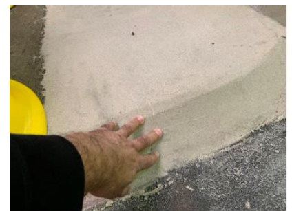
Epoxy Silica Sand Mortar for large fill