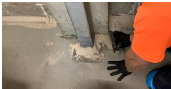
Trowelling Epoxy Mortar into the Corners