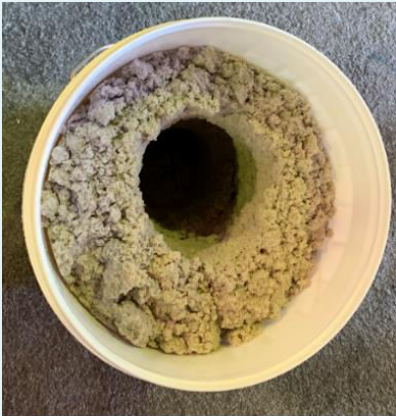
Hole Holding Test – Non-Sagging Epoxy