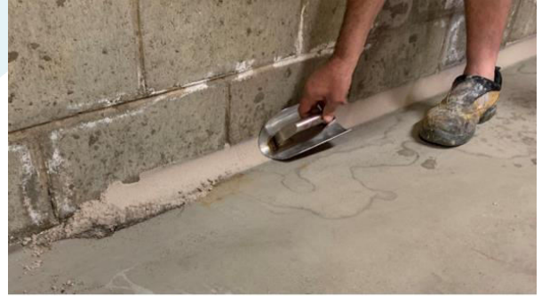
Trowelling Epoxy Mortar into the corner using Coving Device