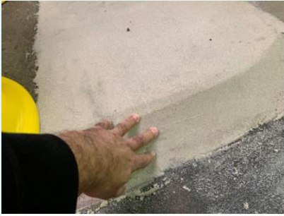
Epoxy Silica Sand Mortar for large fill