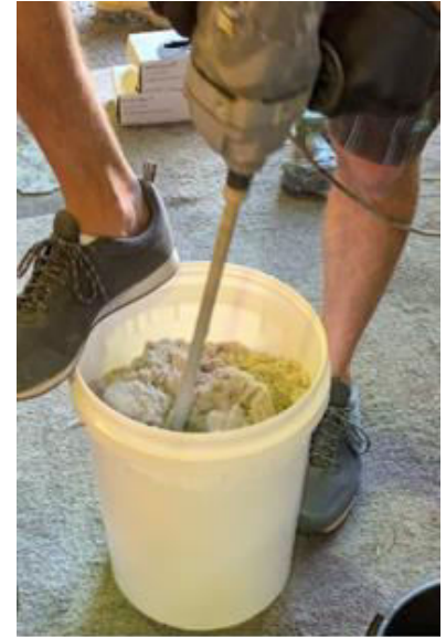
Mixing Epoxy Mortar

The coving application is now complete. Ideally, we recommend to cover it with Epoxy or other coating materials when you apply surface coating to the entire floor.