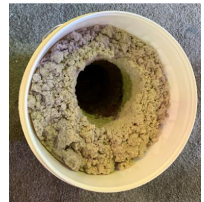
Hole Holding Test – Non-Sagging Epoxy

For small gaps and cracks, or for screeding applications, we recommend use of Super Ceramic as it is lighter and much easier to trowel and apply with better surface finish.