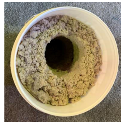
Hole Holding Test – Non-Sagging Epoxy

The Mortar application is now complete. Ideally, we recommend to cover it with Epoxy or other coating materials when you apply surface coating to the entire floor.